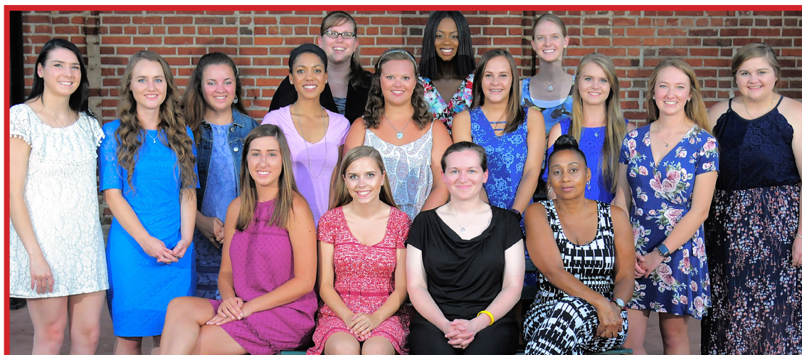
2017 Scholarship Recipients