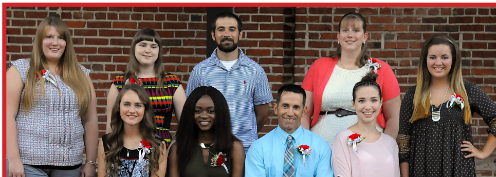
2016 Scholarship Recipients

Awards are to recognize, encourage, and reward students who demonstrate the highest levels of intellectual achievement to outstanding junior, renewable for their senior years. Graduate students are also eligible for this award.